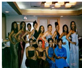
2000 Pageant Participants Dallas, Texas